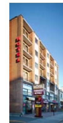
Hôtel Terrasse Royale

Room single 30 $/nuît - meals at the cafeteria : Price chart